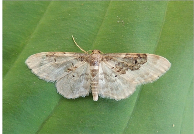
Least Carpet Idaea rusticata Misterton 2017.