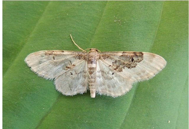
Least Carpet Idaea rusticata Misterton 2017.